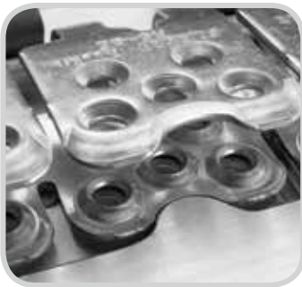
Fast, accurate positioning of fastener strips.